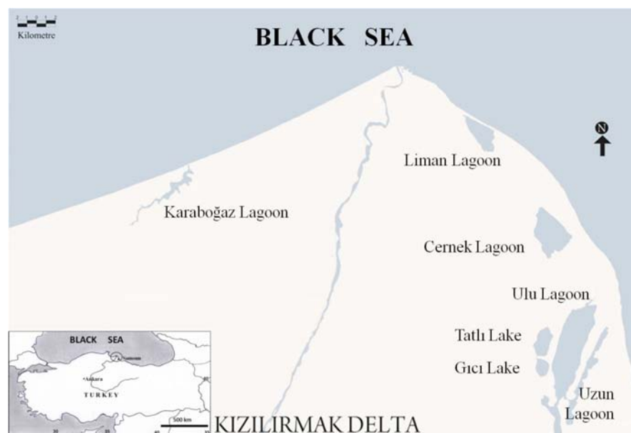
Figure 1. Map of the Lower Kızılırmak Delta and sampling locations

Fish specimens were collected from Bafra Fish Lakes in the Lower Kızılırmak Delta located along the Black Sea coast, Samsun, Turkey (41° 38' N; 36° 04' E) (Figure 1). The delta covers an area of 50,000 ha, which includes freshwater marshes, swamps and 7 lakes and lagoons (Ulu, Uzun, Cernek, Liman, Karaboğaz, Tatlı and Gıcı). Fish samples were collected with the aid of an electro-schock device and fishing net from December 2010 to November 2011. Totally, 16 fish species belonging to 10 families were investigated (Table 1). After capture, fish were